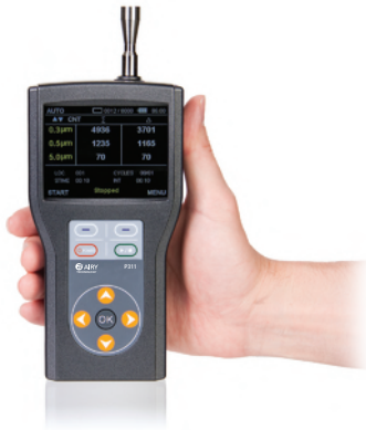
Only 1.26 lbs

The Airy Technology P311 stores 8,000 sample records that can be viewed on the unit or on a computer via USB cable. The P311 complies with ISO 21501-4 and includes a one year warranty. With excellent quality and reliable performance, the Airy Technology P311 is the best priced handheld particle counter in the market.